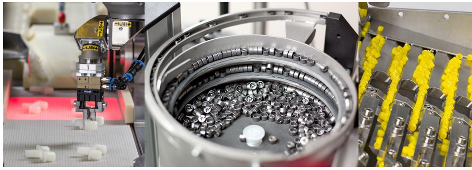
Sorting and Feeding of Rubber Stoppers