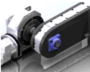
PRECISION BELT CARRIERS Patent N. TO2014A000368