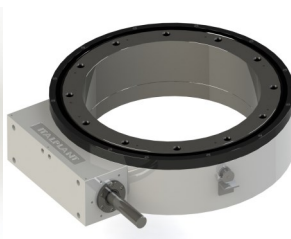
TOROIDAL INDEXER Patent N. 102016000060854