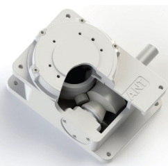
PLASTIC INDEXER Patent N. TO2012A000807