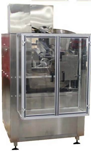
Footprint as small as 40"x43" This includes the bulk hopper!

PHARMACEUTICAL, DAIRY, FOOD, BEVERAGE DETERGENT, MEDICAL DEVICES, HOUSEHOLD & COSMETIC INDUSTRIES