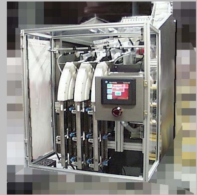
MODEL OT-18-3 Inserting single pretzel salt packs into bagger at 50 per minute