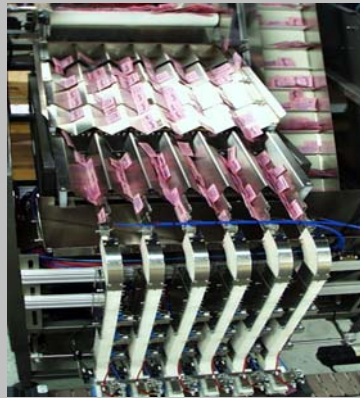
MODEL OT-18-6 Inserting single sweetener packs into cartoner at 210 per minute