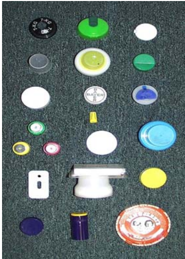
Speeds over 1,200 /min All Types of Caps & Lids