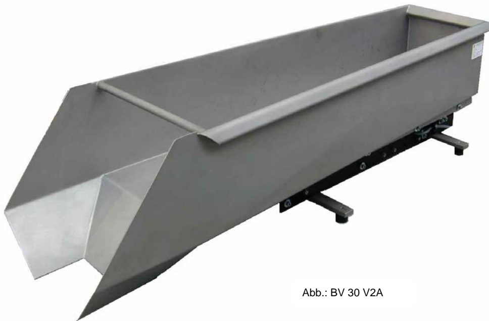
Abb.: BV 30 V2A

The hopper BV 8 – BV 200 are based at the renown series linear feeder type SLL and SLF.