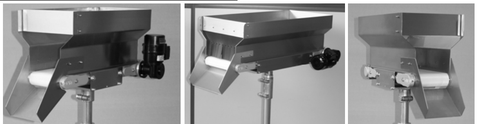
Fig. shows motorposition left